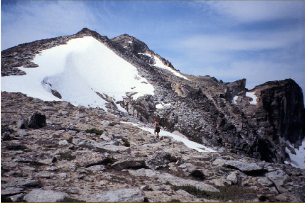
Trapper Peak

Free and open to the public. No companion animals, please.