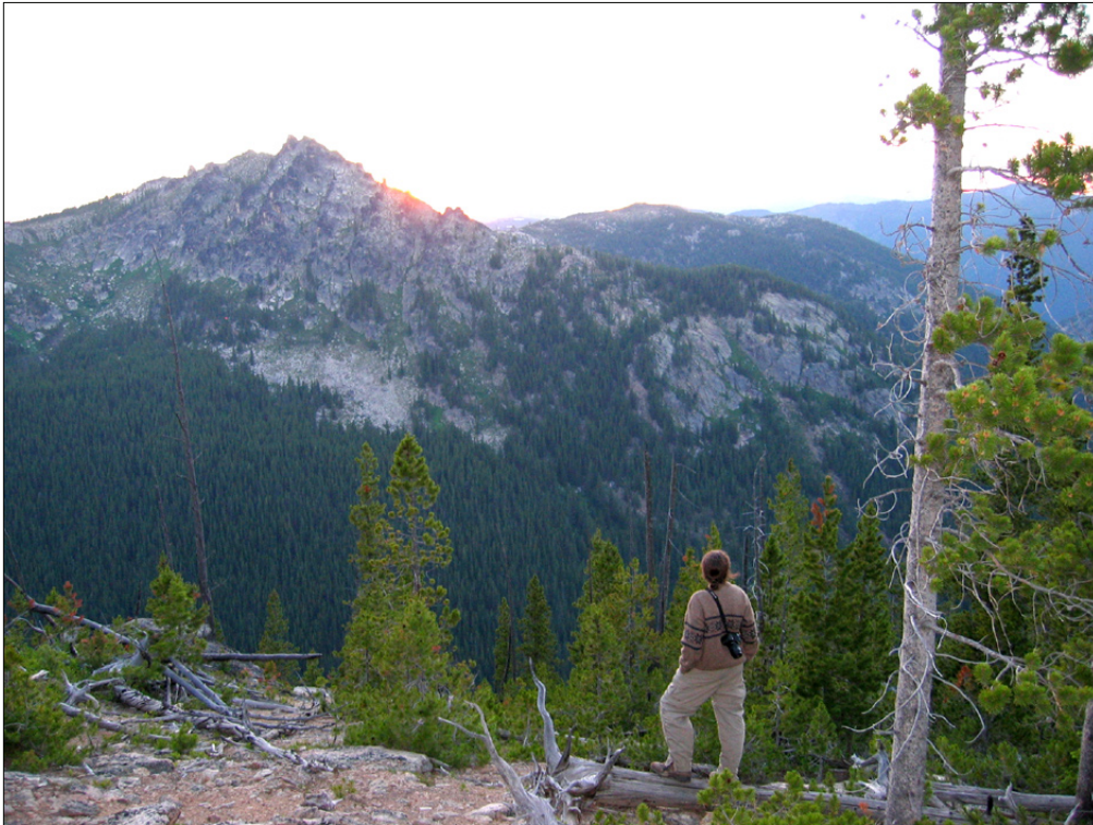
The Great Burn, by Catherine Schrader

Forest Plans direct management on individual forests for the next 15 years. The document influences important management decisions for recommended wilderness, Inventoried Roadless Areas, old growth forests, recreation, protection of critical habitat for T & E species such as bull trout, wildlife corridors, summer and winter range for elk and other wildlife.