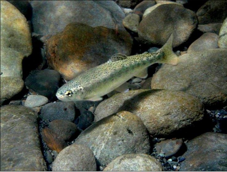
Trout in Elwha

M issoula, MT—Global warming will have profound effects on Montana and the Northern Rockies. A Report commissioned and released by the Sierra Club highlights the impacts of global warming on cold water fisheries. The effects of climate change are already being felt, and will be stressed with increased water temperature and decreases in stream flow. Native fisheries have evolved with, and depend upon, cold water and interconnected habitat for survival. Global warming may constitute the proverbial straw that breaks the camel's back and could lead to the extinction of numerous populations.