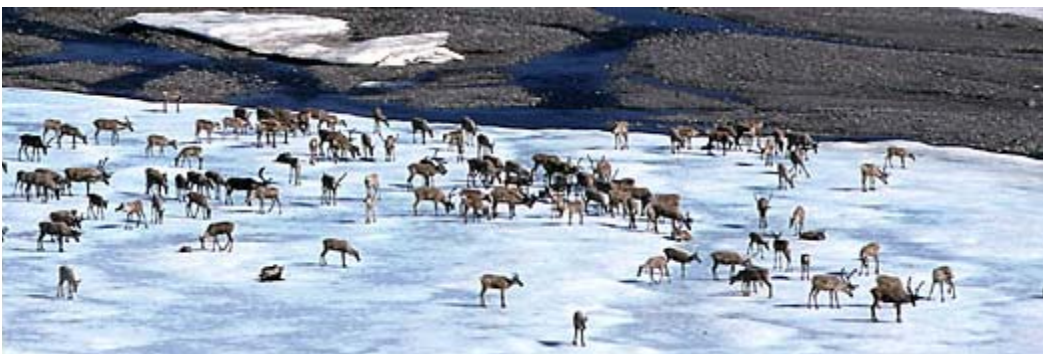
Caribou in the Arctic National Wildlife Refuge.