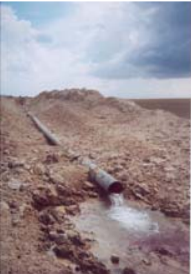
A pipe drains high saline wastewater from Coal Bed Methane drilling.

For more information check the following website http://www.sierraclub.org/cbmethane or contact: Sierra Club—Billings Office 2822 3rd Ave N #208 Billings, MT 59101 Phone: 406-248-4339