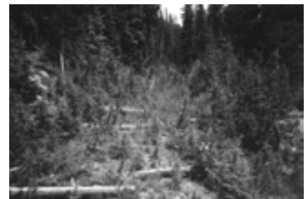
This road is being reclaimed by nature. Lolo National Forest