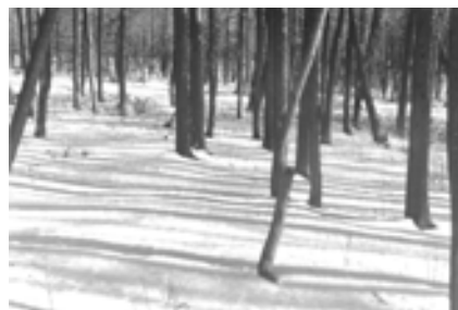
Shadow lines in the snow in a recently burned forest.

were burned on the Flathead National Forest. The 500-page draft EIS includes alternatives that call for decommissioning between 56 and 87 miles of road. Four alternatives lay out varying degrees of salvage