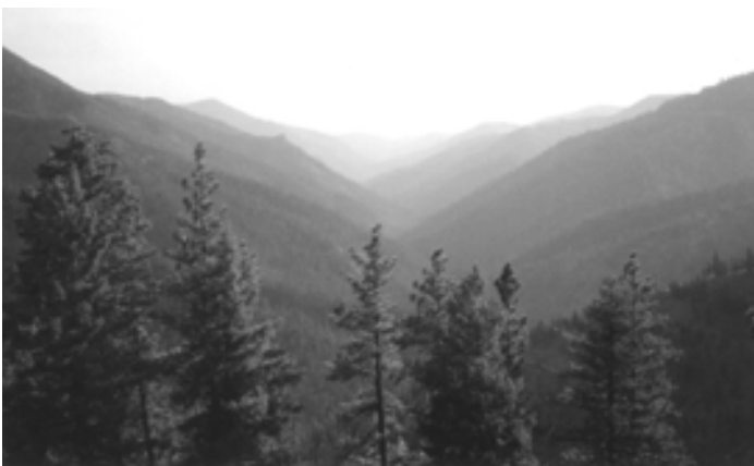
The Van Ness uninventoried roadless area in Lolo National Forest